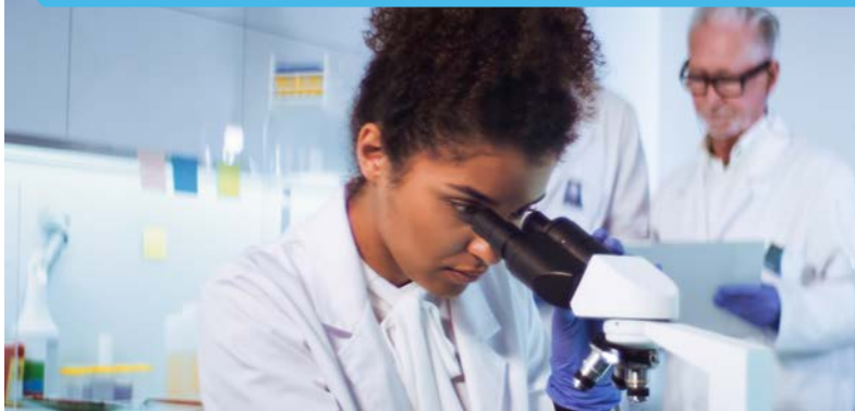
PHASE 1 TRIALS PROGRAM

Talk to your doctor to discuss whether a clinical trial might be right for you and to learn about your options.